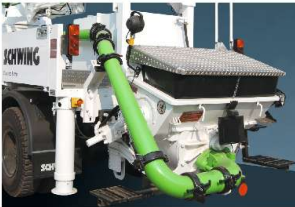
Rock Valve system

Thanks to it's lightweight superstructure and modular design it is possible to mount on a 16 Ton truck that fulfills most of our customer's needs. The compact size of this boom truck makes it usable under bridges, on barges, inside excavation and dam sites. It is the ultimate 'Urban Machine' which can be used to pump many residential jobs with minimum set up time.