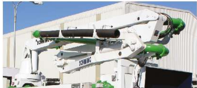
The combined RZ fold