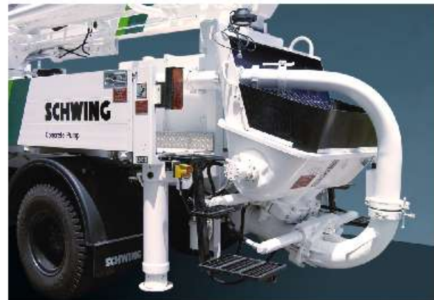
Gate Valve system

The delivery system has options of Flat gate valve / Rock valve system. Flat gate valve is known for its success with tough concrete and Rock valve is known for its pumping characteristics, low wear behavior, rebuilding qualities and safety.